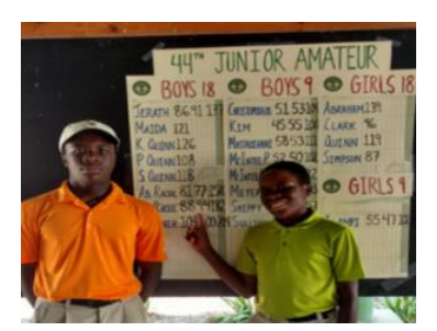
2016 Jackson Park Junior Championship

Going through my cancer journey, I realized that the only thing that was going to save my life was hope. That's what everybody should have. That's why golf is the greatest game in the world. It's all about hope that you're going to play your greatest round or hit your greatest shot.